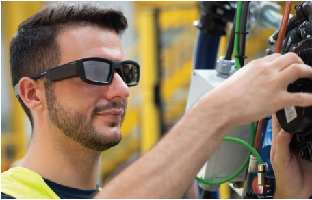
Remote field instructions