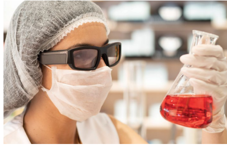
Real-time, hands-free information