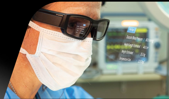
Immediate mobile access to patient data & tests