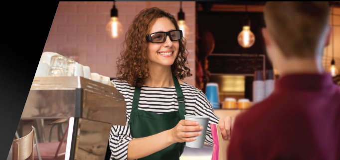
Enhancing service in retail through mobile hands-free access

The first Augmented Reality (AR) Smart Glasses featuring advanced waveguide optics for hands-free mobile computing & connectivity.