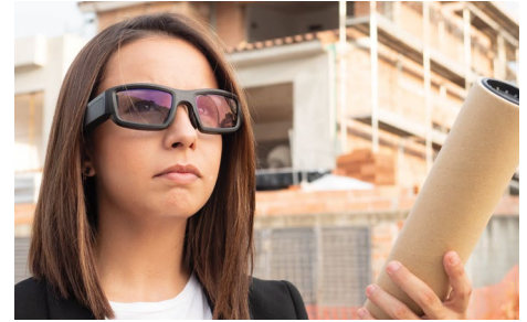
Receive work instructions on the job